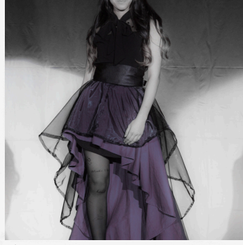
Designer: Chinatsu Terao Model: .....