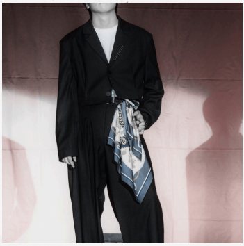
Designer & Model: Yanada Yuto